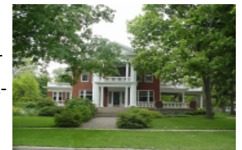
Historic Home in St. Johns

Hazel I. Findley, an award winning facility, offers extended nursing care. Clinton Commons accommodates adults with independent living apartments.