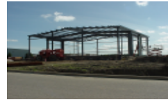
Construction in the St. Johns Industrial Park